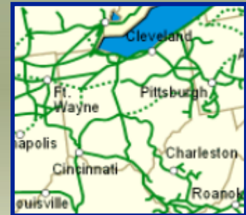
Norfolk Southern System Map

Competition: Three railroad companies show service available along the main east-west line. The Ohio Central Railroad, a regional company, is the primary service provider. National companies, Norfolk Southern and CSXT, also demonstrate service availability in the area.