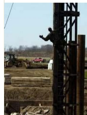
A construction worker signals his coworkers as he climbs a pile driver while a crew sets a pile into the device Thursday afternoon off Irving Wick Drive in Heath. The piles are for a bridge that is part of the James Parkway extension.